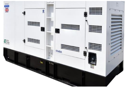
Silent / Closed Type