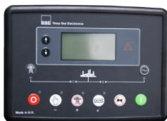
DSE6120 MKII AUTO START & AUTO MAINS FAILURE CONTROL