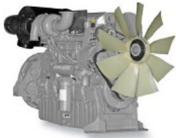
PERKINS Engine 2806A-E18TAG1A