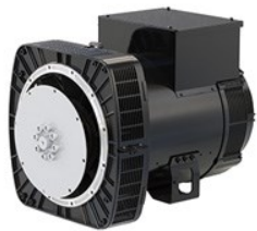
Leroy Somer TAL-042-H