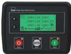
DSE4530 MKII AUTO START & AUTO MAINS FAILURE CONTROL