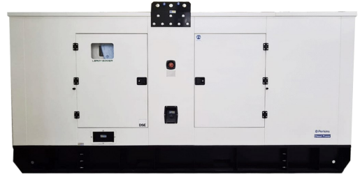
Silent / Closed Type Image for illustration purposes only.