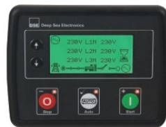
DSE4530 MKII AUTO START & AUTO MAINS FAILURE CONTROL