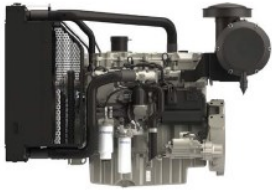
PERKINS Engine 1506A-E88TAG5