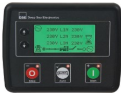
DSE4530 MKII AUTO START & AUTO MAINS FAILURE CONTROL