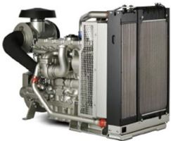
PERKINS Engine 1106A-70TAG4