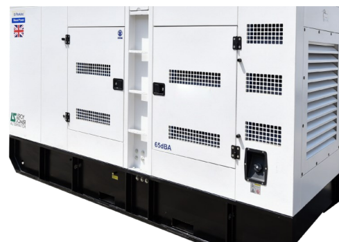
Silent / Closed Type Image for illustration purposes only.