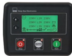
DSE4530 MKII AUTO START & AUTO MAINS FAILURE CONTROL