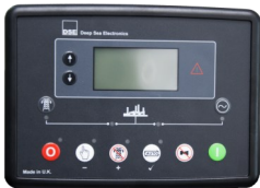
DSE6120 MKII AUTO START & AUTO MAINS FAILURE CONTROL