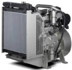
PERKINS Engine 1106A-70TAG2