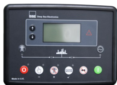
DSE6120 MKII AUTO START & AUTO MAINS FAILURE CONTROL