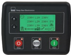
DSE4520 MKII AUTO START & AUTO MAINS FAILURE CONTROL