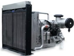
PERKINS Engine 2806A-E18TTAG5