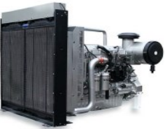
PERKINS Engine 4006-23TAG2A