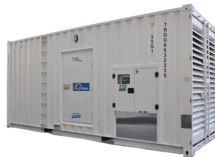
Silent / Closed Type Image for illustration purposes only.