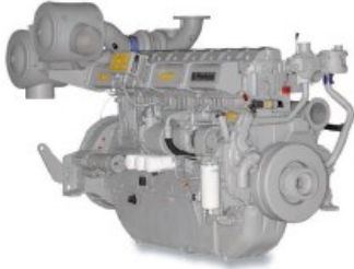
PERKINS Engine 4012-46TAG2A