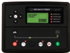
DSE7320 MKII AUTO START & AUTO MAINS