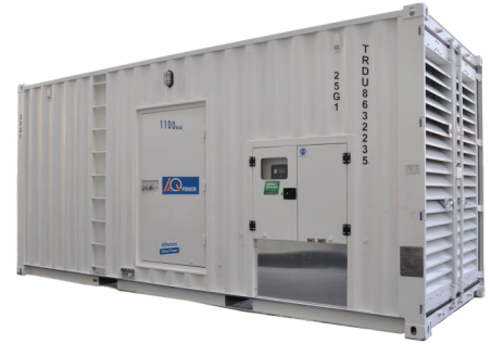
Silent / Closed Type